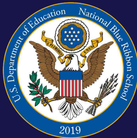
US Dept. of Education National Blue Ribbon School 2019