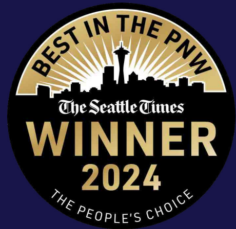
Best in the PNW 2024 Winner