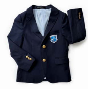
NCA BLAZER Sizes: 4-5T to 14Y MSRP: $85 | Navy