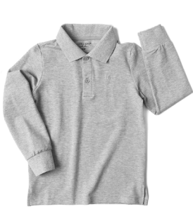
BASIC LONG SLEEVE POLO Sizes: 4-5T to 14Y MSRP: $30 | Grey