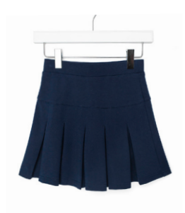
BASIC SKORT Sizes: 4-5T to 16Y MSRP: $28 | Navy