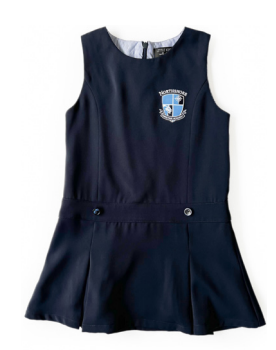
JUMPER DROP WAIST Sizes: 4-5T to 16Y MSRP: $40