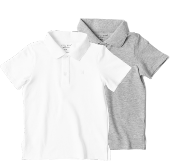
BASIC POLO SHIRT Sizes: 4-5T to 14Y MSRP: $28 | White, Grey