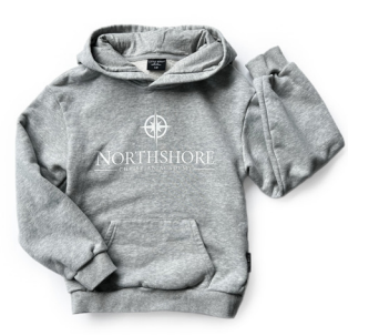
P.E. HOODIE Sizes: 4-5T to 2XL MSRP: $42-$45