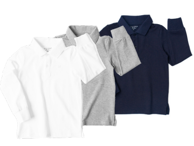
BASIC LONG SLEEVE POLO Sizes: 4-5T to 2XL MSRP: $30-$36 White, Grey or Navy