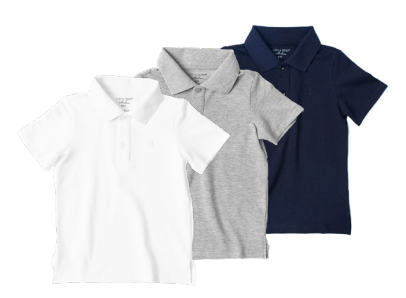
BASIC POLO SHIRT Sizes: 4-5T to 2XL MSRP: $28-$35 White, Grey or Navy