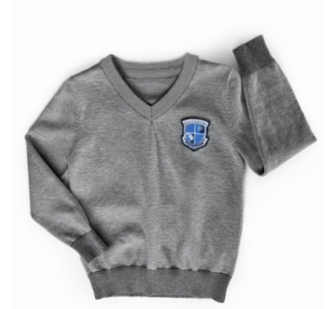
LONG SLEEVE SWEATER Sizes: 4-5T to 16Y MSRP: $35 | Heather Grey