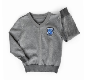
LONG SLEEVE SWEATER Sizes: 4-5T to 2XL MSRP: $35-$40