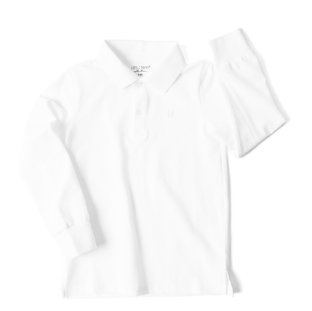
BASIC LONG SLEEVE POLO Sizes: 4-5T to 14Y MSRP: $30 | White