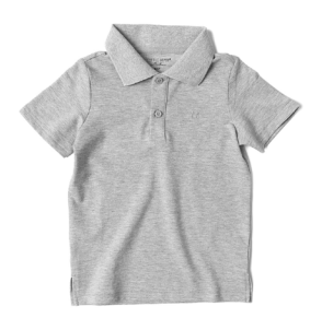
BASIC POLO SHIRT Sizes: 4-5T to 14Y MSRP: $28 | Grey