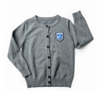
BUTTON UP SWEATER Sizes: 4-5T to 16Y MSRP: $35 | Heather Grey