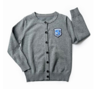
BUTTON UP SWEATER Sizes: 4-5T to 16Y MSRP: $35 | Heather Grey