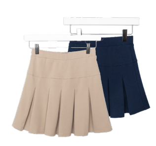
BASIC SKORT Sizes: 4-5T to 2XL MSRP: $28-$30 Camel, Navy