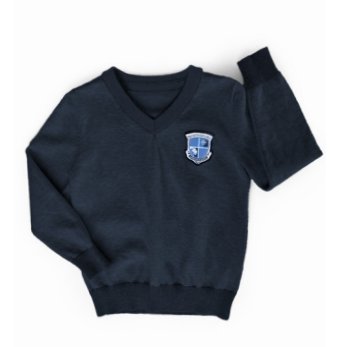
LONG SLEEVE SWEATER Sizes: 4-5T to 16Y MSRP: $35 | Navy