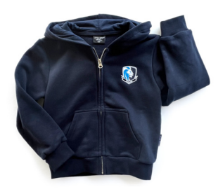
ZIP UP HOODIE Sizes: 4-5T to 2XL MSRP: $50-$55