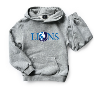
LION'S HOODIE Sizes: 4-5T to 2XL MSRP: $42-$45