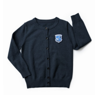
BUTTON UP SWEATER Sizes: 4-5T to 16Y MSRP: $35 | Navy