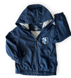
WINDBREAKER Sizes: 4-5T to 2XL MSRP: $40-$45