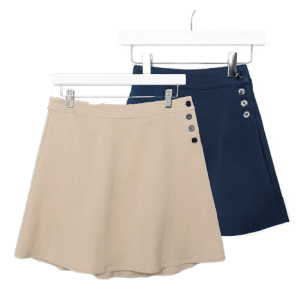
BASIC SKIRT Sizes: 4-5T to 2XL MSRP: $28-$30 Camel, Navy