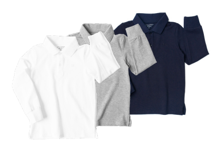
BASIC LONG SLEEVE POLO Sizes: 4-5T to 2XL MSRP: $30-$36 White, Grey or Navy