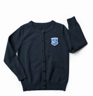
BUTTON UP SWEATER Sizes: 4-5T to 16Y MSRP: $35 | Navy