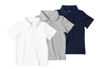
BASIC POLO SHIRT Sizes: 4-5T to 2XL MSRP: $28-$35 White, Grey or Navy