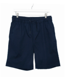
BASIC CHINO SHORT Sizes: 4-5T to 14Y MSRP: $28 | Navy