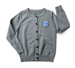
BUTTON UP SWEATER Sizes: 4-5T to 2XL MSRP: $35-$40