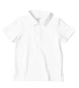
BASIC POLO SHIRT Sizes: 4-5T to 14Y MSRP: $28 | White

BASIC LONG SLEEVE POLO Sizes: 4-5T to 14Y MSRP: $30 | Grey