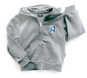
ZIP UP HOODIE Sizes: 4-5T to 2XL MSRP: $50-$55