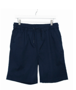
BASIC CHINO SHORT Sizes: 4-5T to 14Y MSRP: $28 | Navy