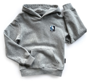
HOODIE PULLOVER Sizes: 4-5T to 2XL MSRP: $42-$45