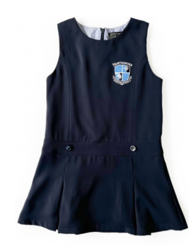
JUMPER DROP WAIST Sizes: 4-5T to 16Y MSRP: $40