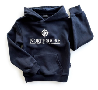
P.E. HOODIE Sizes: 4-5T to 2XL MSRP: $42-$45