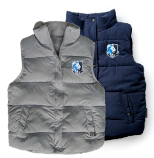
PUFFER VEST Sizes: 4-5T to 2XL MSRP: $48-$55