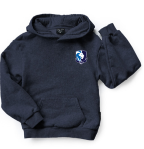
HOODIE PULLOVER Sizes: 4-5T to 2XL MSRP: $42-$45