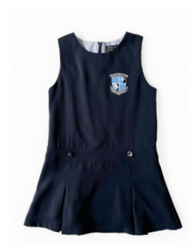
GIRL'S JUMPER DROP WAIST Sizes: 4-5T to 16Y MSRP: $40 | Navy