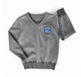
LONG SLEEVE SWEATER Sizes: 4-5T to 2XL MSRP: $35-$40