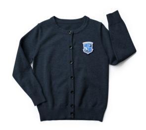
BUTTON UP SWEATER Sizes: 4-5T to 2XL MSRP: $35-$40