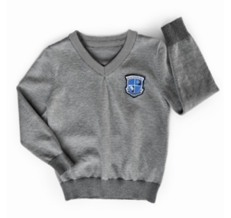
LONG SLEEVE SWEATER Sizes: 4-5T to 16Y MSRP: $35 | Heather Grey