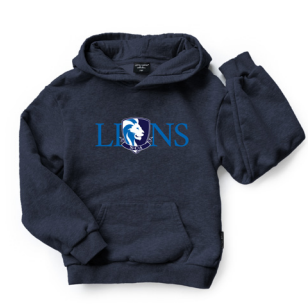
LION'S HOODIE Sizes: 4-5T to 2XL MSRP: $42-$45