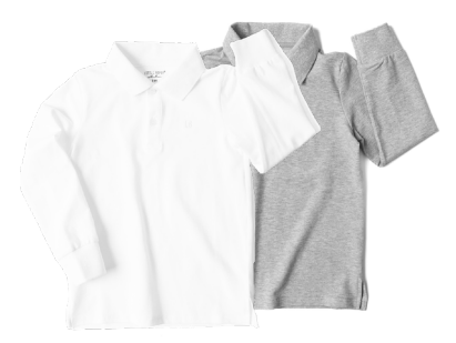
BASIC LONG SLEEVE POLO Sizes: 4-5T to 14Y MSRP: $30 | White, Grey