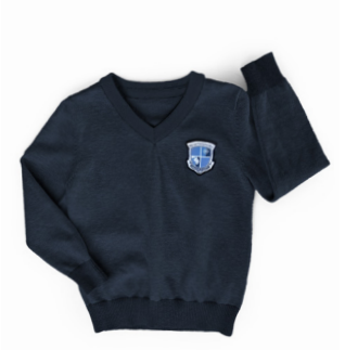
LONG SLEEVE SWEATER Sizes: 4-5T to 16Y MSRP: $35 | Navy